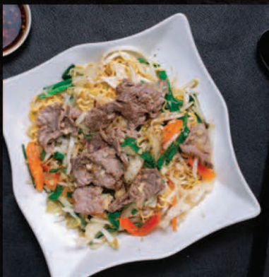
▲ 307 Mi Xao Bo 牛肉炒面 Fried Beef Noodles RM13.90