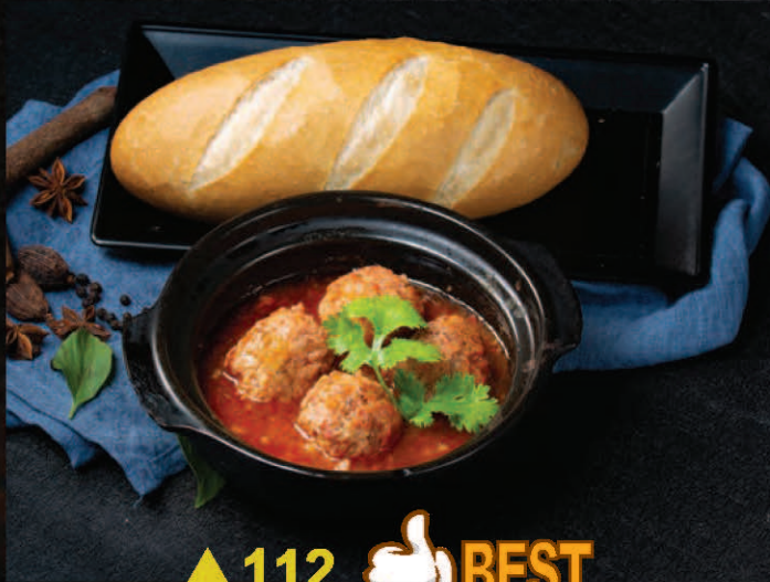
▲ 112 🍷 BEST Banh Mi Xiu Mai 越式猪肉烧卖 Banh Mi Viet Meat Balls RM13.90