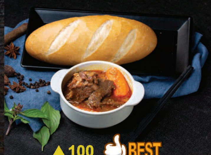
▲ 100 🍷 BEST Banh Mi Bo Kho 越式炖牛肉三明治 Stew Beef RM14.50