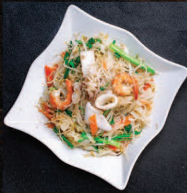
▲ 304 Bun Xao Hai San 海鲜炒米粉 Fried Seafood Meehoon RM13.90