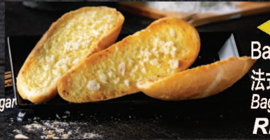
◀ 114 Banh Mi Nuong Toi 法式香蒜奶油麵包 Baguette Toast Garlic Butter RM6.20