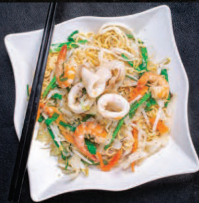
▲ 306 Mi Xao Hai San 海鲜炒面 Fried Seafood Noodles RM13.90