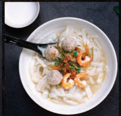
▲ 313 Banh Canh Man 越式手工白粿猪肉汤面 Rice Cake Noodle Soup (Homemade Noodle) RM13.90