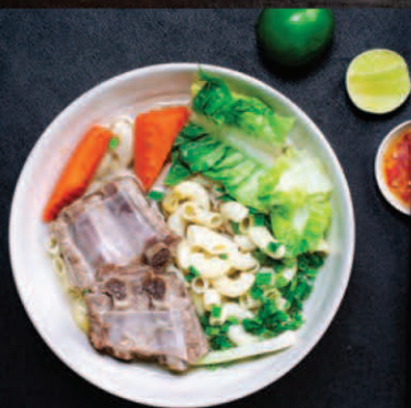
▲ Nuoi Suon 清汤排骨通心粉 301 Macorroni Pork Ribs Soup RM12.50