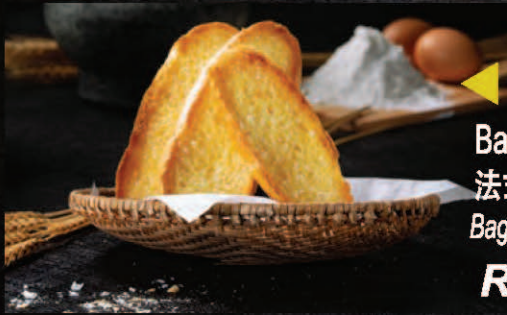
◀ 113 Banh Mi Duong Bo 法式吐司 (奶油/糖) Baguette Toast Butter / Sugar RM6.20