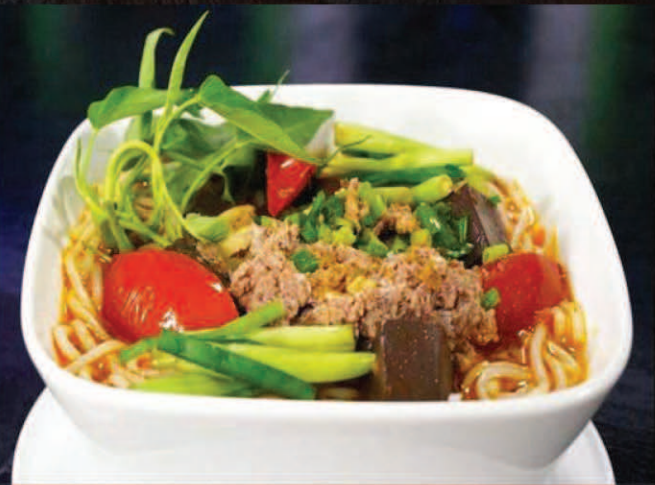
316 ▲ Canh Bun RM14.90 越式蕹菜湯麵(米粉) Water Spinach Noodle Soup (Beehoon)