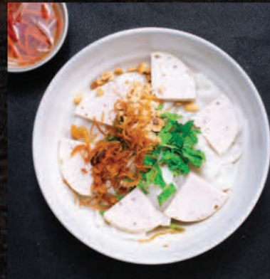
▲ 305 Banh Uot Cha Lua 越式火腿猪肠粉拌鱼露 Viet Ham Chee Cheong Fun RM13.90