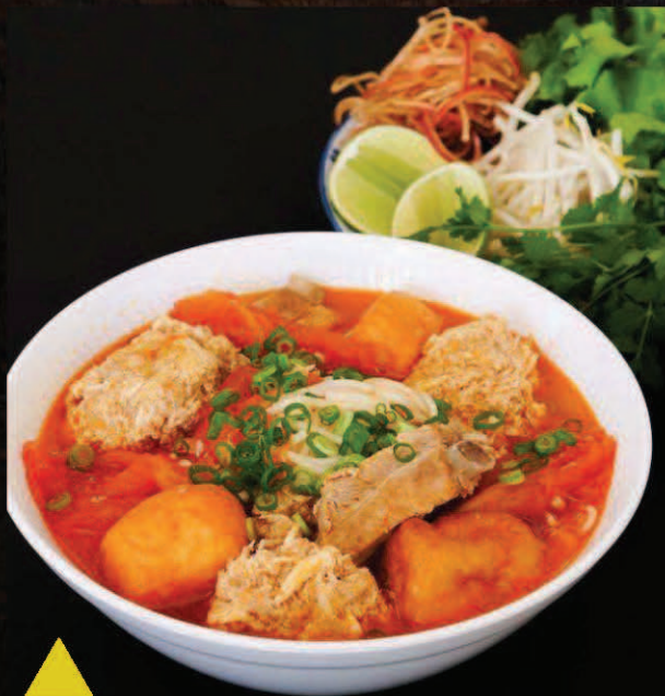
315 ▲ Bun Rieu RM14.90 番茄汤底米粉汤 Pork Tomato Noodle Beehoon