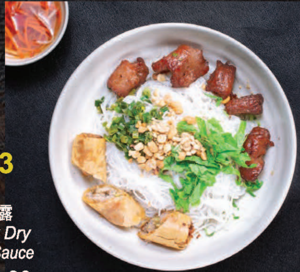
Bun Thit Nuong Cha Gio 香烤猪肉春卷干米粉拌鱼露 Vermicelli Bowl Grill Pork Dry & Spring Roll With Fish Sauce RM13.90