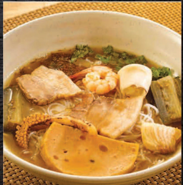
308 ▲ Bun Mam RM15.90 越式海鲜米粉汤 Viet Seafood MeeHoon Jinjeruk Soup