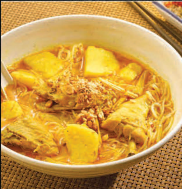
309 ▲ Bun Cari Ga RM13.90 越式咖喱鸡米粉 Viet Curry Chicken Meehoon